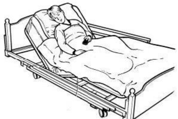
Half-sitting position during treatment.

Step 2: the chemotherapy will be given for a period of 30 minutes to 3 hours depending on your oncologist's orders. During this time you will not be able to go to the bathroom