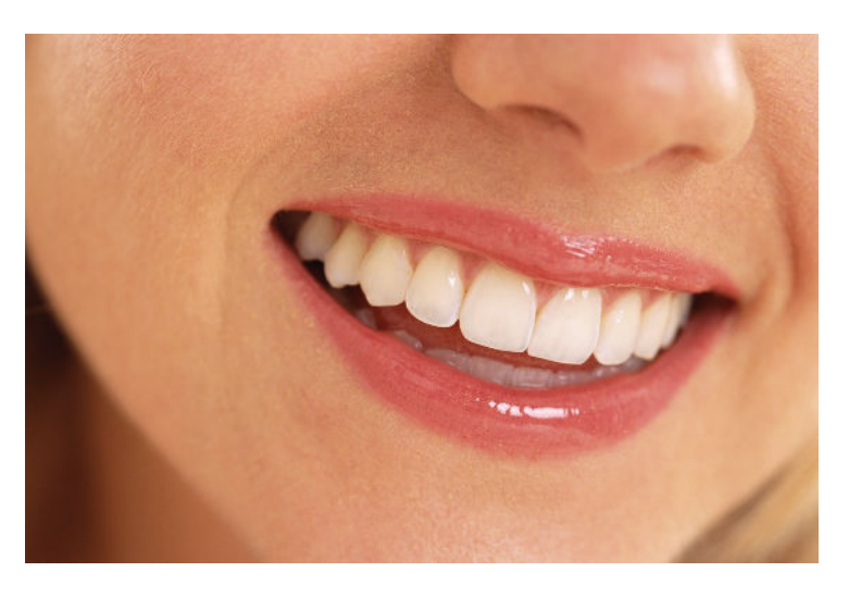
A Resource For Dental Health Professionals